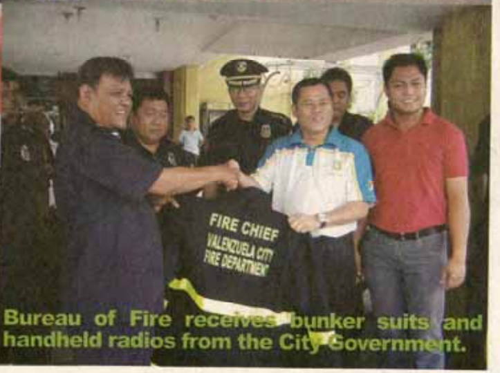
Bureau of Fire receives bunker suits and handheld radios from the City Government.