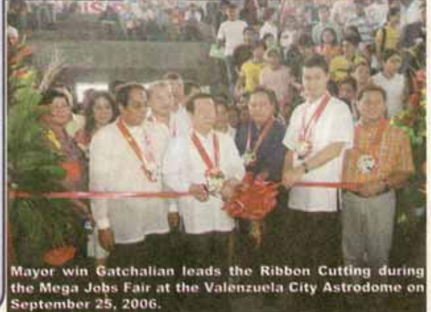
Mayor win Gatchalian leads the Ribbon Cutting during the Mega Jobs Fair at the Valenzuela City Astrodome on September 25, 2006.