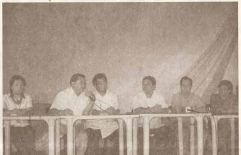
Anti-Dengue Task Force Emergency Press Conference with DOH Secretary Francisco Duque

Furthermore, the Secretary of Health lauded the City Government of Valenzuela for being the first LGU to have formed an Avian Flu Task Force. Its anti-avian flu program is hoped to serve as the model for the other LGUs across the country.