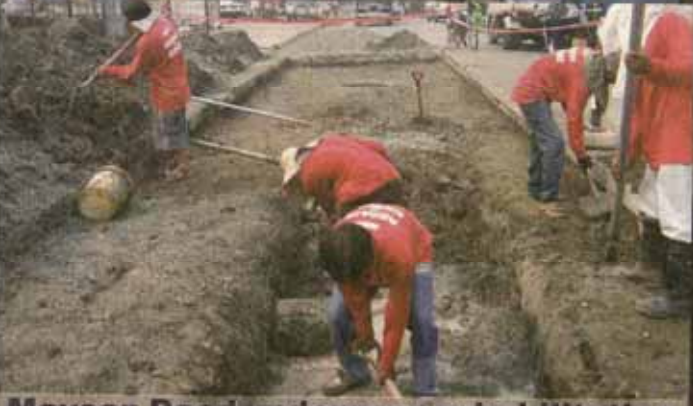
Maysan Road undergoes rehabilitation as part of the VC 21st program of the City Government.