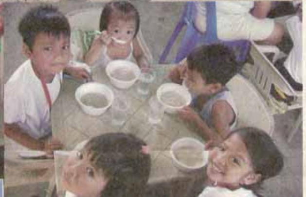
Feeding Activity in Bgy. Coloong