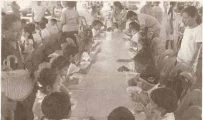
Day Care Children in Barangay Coloong participate in the feeding activity of the City Government.